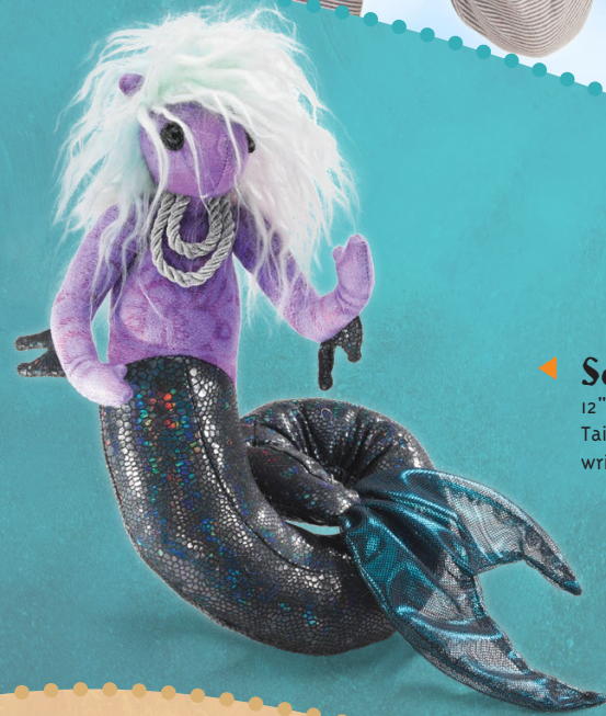
◀ Sea Nymph 12" long 3171 Tail wraps around wrist.