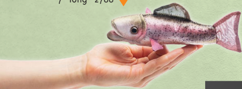
mini Rainbow Trout ▶ 7" long 2788 ▼