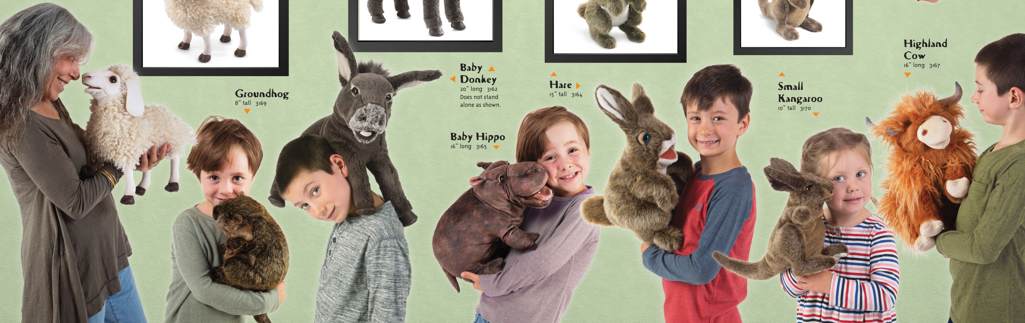
Baby Hippo 16" long 3165 ▼