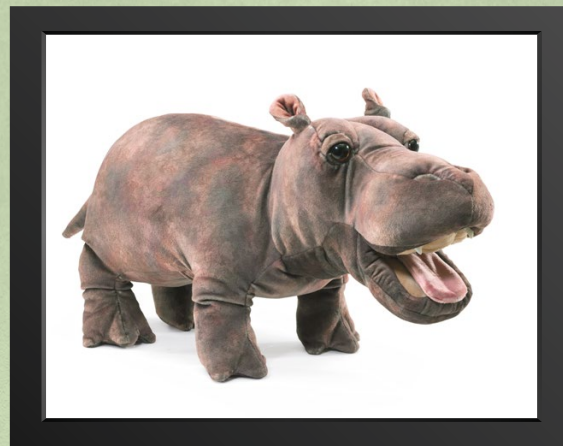
Baby Hippo 16" long 3165 ▼