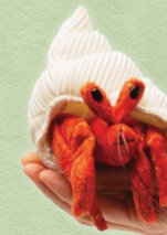
mini Hermit Crab 6" long 2786 ▼ Pulls into shell.