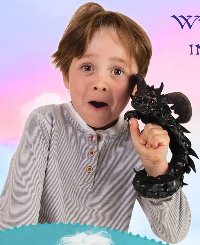
◀ Dragon Wristlet 12" long 3163 Magnets secure tail.